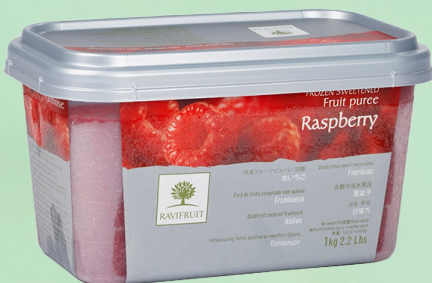
EH932 Puree Raspberry Sweeten Frz

Liven up your bar and dessert offerings. From exotic to classics, RaviFruit Puree's add the wow .