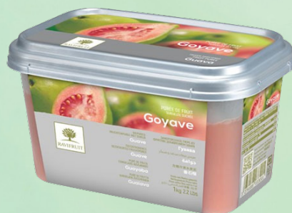
EH938 Puree Guava Pink Fruit SW Frz