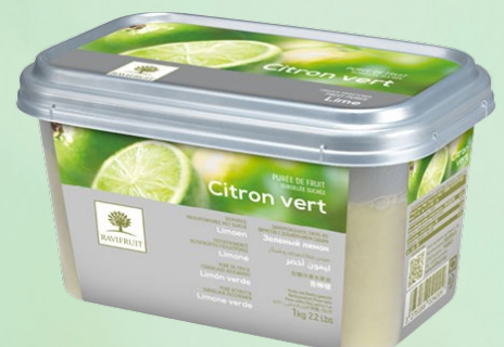
WA326 Puree Lime Frz