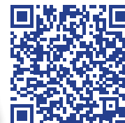
Seasonal Fresh Seafood List